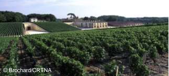
MEDOC AND ITS CHÂTEAU WINERIES

Bordeaux : 3* Hôtel Moxy, Casa Gaïa organic restaurant. Cognac : 4* Hôtel François.